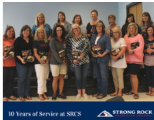
10 Years of Service at SRCS

Congratulations to these staff members for serving Strong Rock for 10 years and 5 years!