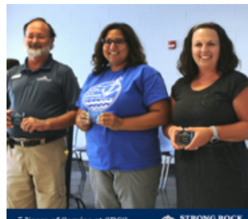
5 Years of Service at SRCS